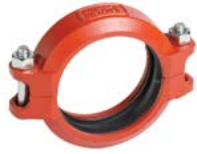
1 – 8"/DN25 – DN200